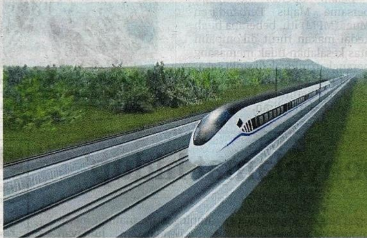
LAKARAN artis projek Landasan Kereta Api Berkelajuan Tinggi yang menghubungkan Bangkok dengan Nong Khai.

"Kami terus mencuba sebaiknya bagi membida projek-projek baharu untuk Kumpulan Bina Puri bagi memastikan pe-