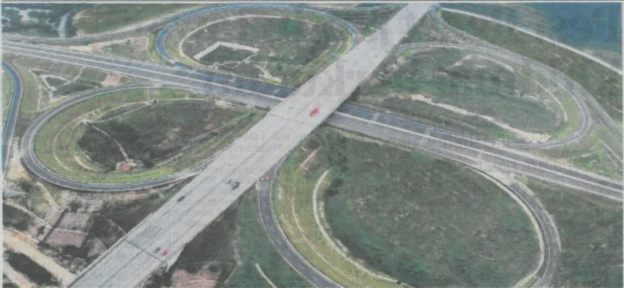
Antara projek lebuh raya, jambatan dan susur keluar dibina oleh Bina Puri.