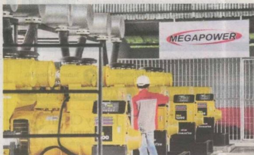
Bina Puri Holdings Bhd's unit, PT Megapower Makmur, is the first non-government-linked company to successfully list on the Indonesia Stock Exchange.

KUALA LUMPUR: Bina Puri Holdings Bhd's unit, PT Megapower Makmur, made a sterling debut on the Indonesia Stock Exchange on Wednesday with an opening price of 340 rupiah (11 sen), up 70 per cent from the offer price of 200 rupiah per share.