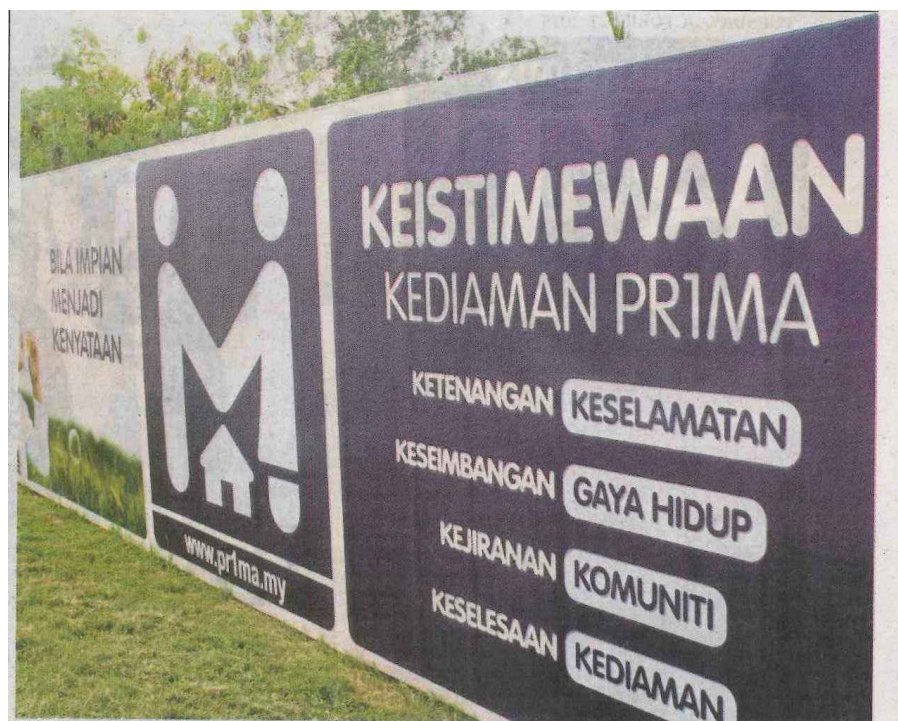
Bina Puri Holdings Bhd has received a letter of intent from PR1MA Corp Malaysia to build four blocks of apartments and 20 units of shops in Plentong, Masai in Johor.