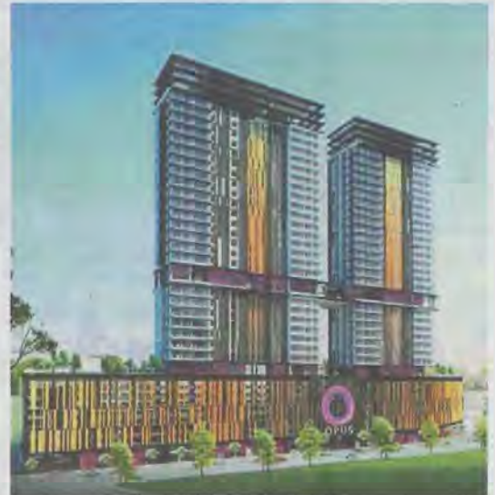
ILUSTRASI artis projek perumahan OPUS Kuala Lumpur yang bakal dibangunkan oleh Bina Puri Holdings Bhd.

Tambah Tee, projek yang dibangunkan dengan nilai pembangunan kasar (GDV) sebanyak RM344 juta itu telah dilancarkan pada Jun tahun lalu turut dilengkapi dengan kemudahan-kemudahan asas seperti sistem keselamatan, kolam renang, taman rekreasi, kolam re-