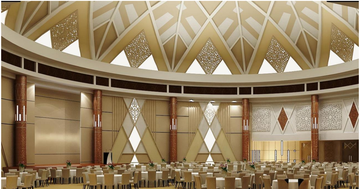
The Dining Hall