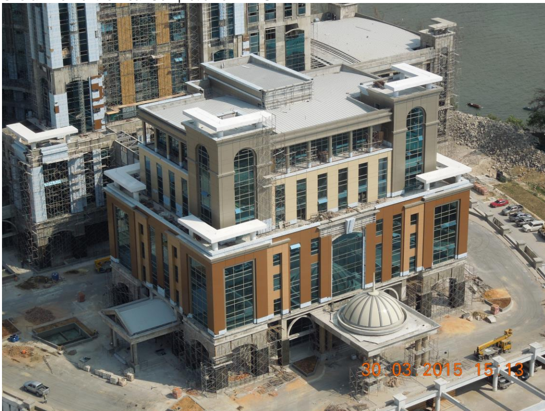
Block B of PPNS