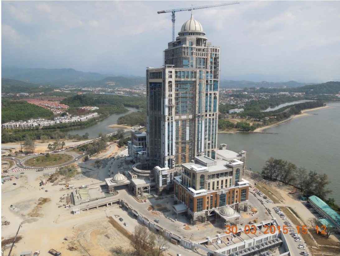
Overall View of the Near Completion of PPNS