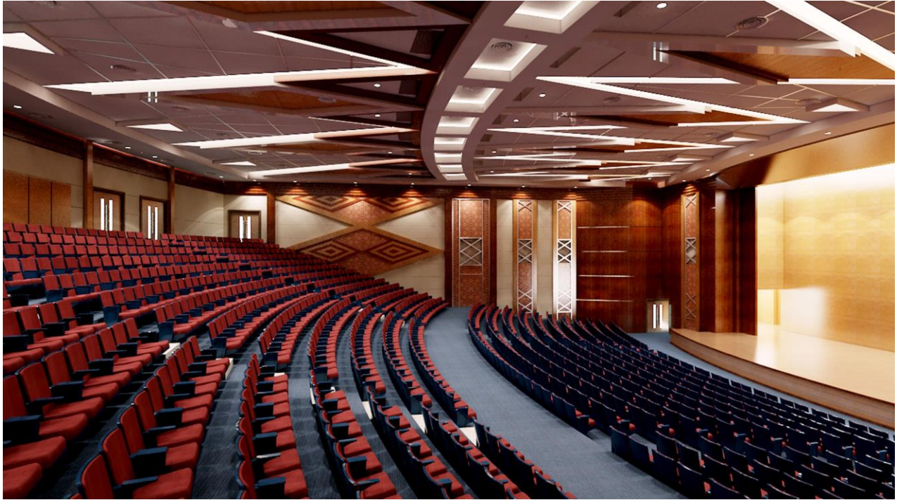
The Auditorium Hall