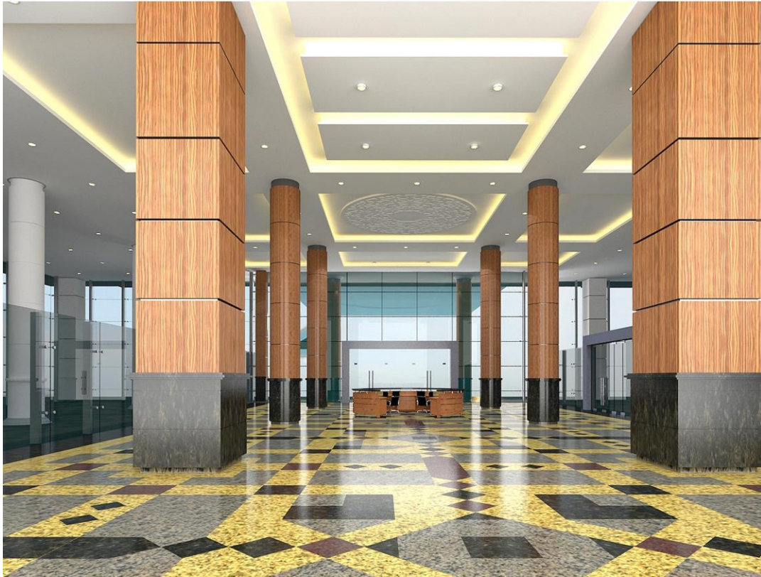
The Main Lobby of Block A