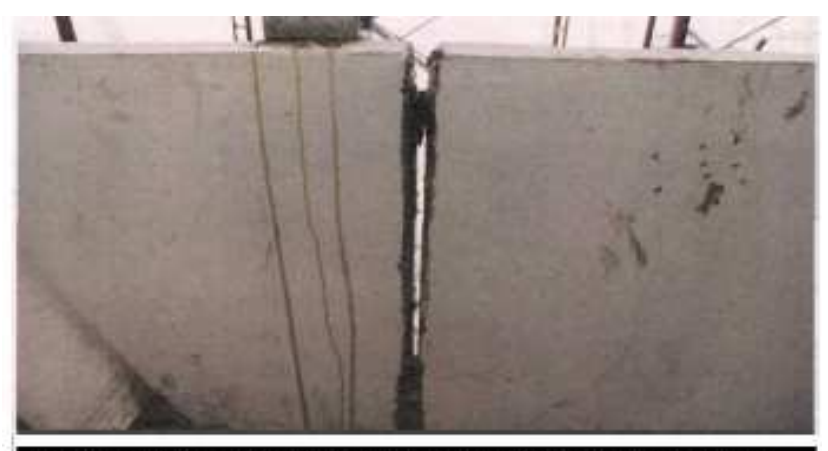
A gap in a wall at the klia2 building. The airport's project manager and main contractor have failed to obtain a Certificate of Completion and Compliance for the terminal building.

From: Group Corporate Communication DepartmentDate: 7th February 2014Subject: Bina Puri News Update