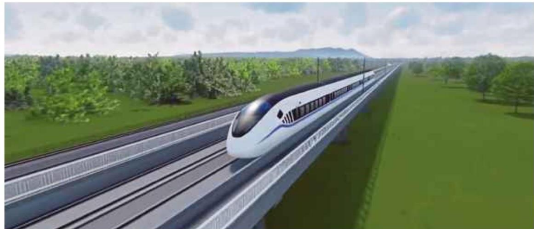
An artist's impression of the high-speed rail project which will connect regions in Bangkok-Nong Khai section (Phase 1 Bangkok-Nakhon Ratchasima section) with Khok Kruat-Nakhon Ratchasima section.

The total length of the project package is 13.68km, comprising a railway route of 12.38km.