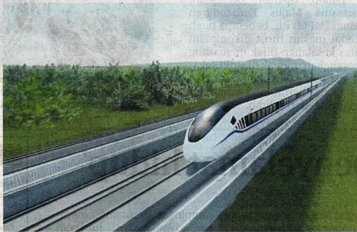
LAKARAN artis projek Landasan Kereta Api Berkelajuan Tinggi yang menghubungkan Bangkok dengan Nong Khai.

“Kami terus mencuba sebaiknya bagi membida projek-projek baharu untuk Kumpulan Bina Puri bagi memastikan pe-