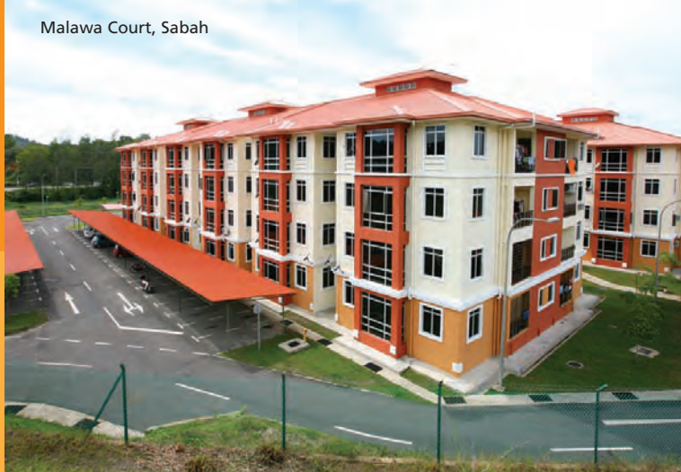
Malawa Court, Sabah

Bina Puri Properties Sdn. Bhd. is also the developer of 86 units of 2-Storey Terrace Houses in Taman Malawa Jaya and Phase II of 96 units of 4 storey apartments in Sepanggar Bay, Kota Kinabalu, Sabah.