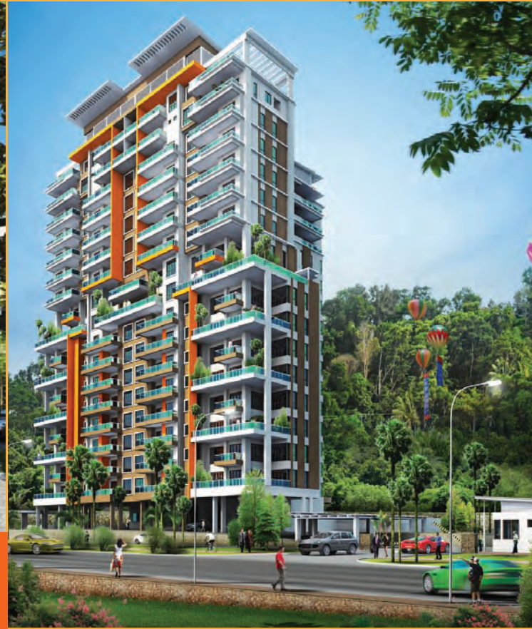
Jesselton View, Kota Kinabalu

Type : 80 luxurious units with the floor area ranging from 1,242 to 3,800 sq. feet Amenities: Sky lounge, sky garden, swimming pool, wading pool, Jacuzzi, BBQ deck, gymnasium, 24 hours security, in-door and out-door CCTV, children's playground and covered car park Land Size: 2.00 acres Accessibility: Jalan Lintas and surrounded by well established housing estate roads