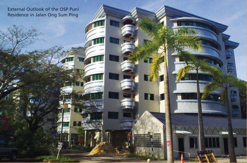
External Outlook of the OSP Puni Residence in Jalan Ong Sum Ping

Bina Puri ventured into the hospitality services with our maiden project being the OSP Puni Residence, located at Jalan Ong Sum Ping, in Brunei Darussalam. The Group is in the midst of refurbishing and upgrading three (3) blocks of 72 units unoccupied apartments into modern serviced apartments.