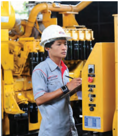
The various resources and activities at the power plant