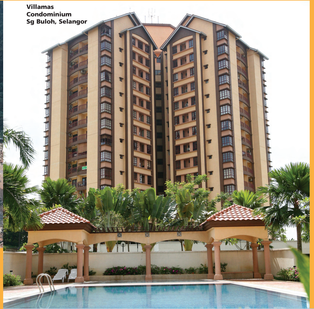
Villamas Condominium Sg Buloh, Selangor

Ideal Heights Properties Sdn. Bhd. is the developer of the 139 acre Bukit Idaman Township in Selangor which started way back in 1984. It is a mixed development which comprises of more than 2,000 units of low cost and middle cost apartments, terrace houses, shop houses and condominiums. Ideal Heights also completed several other developments including the Taman Villamas in Sg Buloh, the Idaman Villa Houses in Cheras, the Taman Puchong Impian 2 in Puchong and a Factory Outlet in Dengkil.