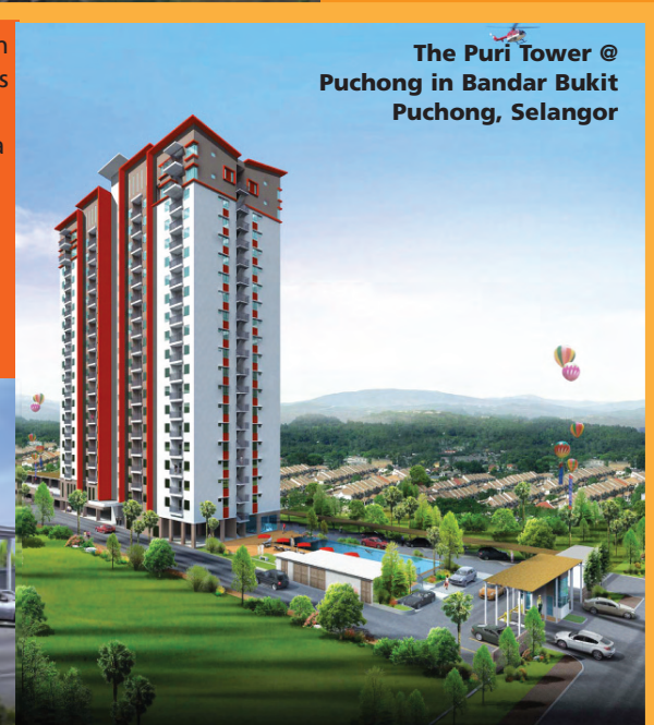
The Puri Tower @ Puchong in Bandar Bukit Puchong, Selangor

Type: 1 block, 20 storey condominium with 130 units of exclusive apartments and 8 units of penthouse. Amenities: Multi purpose hall, two shops, a surau, gym, swimming pool & beautifully landscaped Land Size: 1.97 acres Accessibility: Situated in Bandar Bukit Puchong, accessed via LDP near Pusat Bandar Puchong