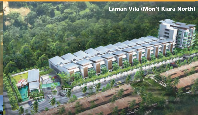
Laman Vila (Mon't Kiara North)

Bina Puri Properties Sdn. Bhd. is a subsidiary which is involved in property development, and has successfully completed the Jesselton Condominium in Kota Kinabalu, Sabah.