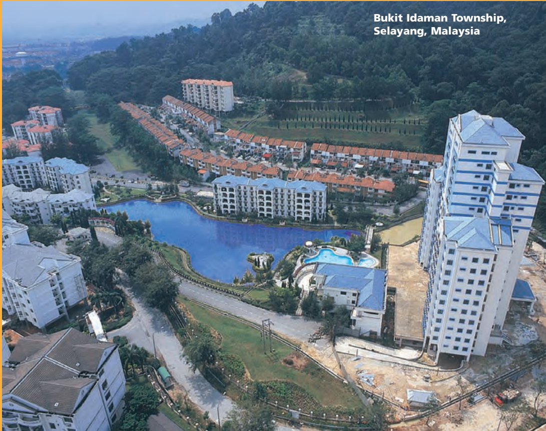
Bukit Idaman Township, Selangor, Malaysia

Ideal Heights Properties Sdn. Bhd. is the developer of the 139 acre Bukit Idaman Township in Selangor which started way back in 1984. It is a mixed development which comprises of more than 2,000 units of low cost and middle cost apartments, terrace houses, shop houses and condominiums. Ideal Heights also completed several other developments including the Taman Villamas in Sg Buloh, the Idaman Villa Houses in Cheras, the Taman Puchong Impian 2 in Puchong and a Factory Outlet in Dengkil.