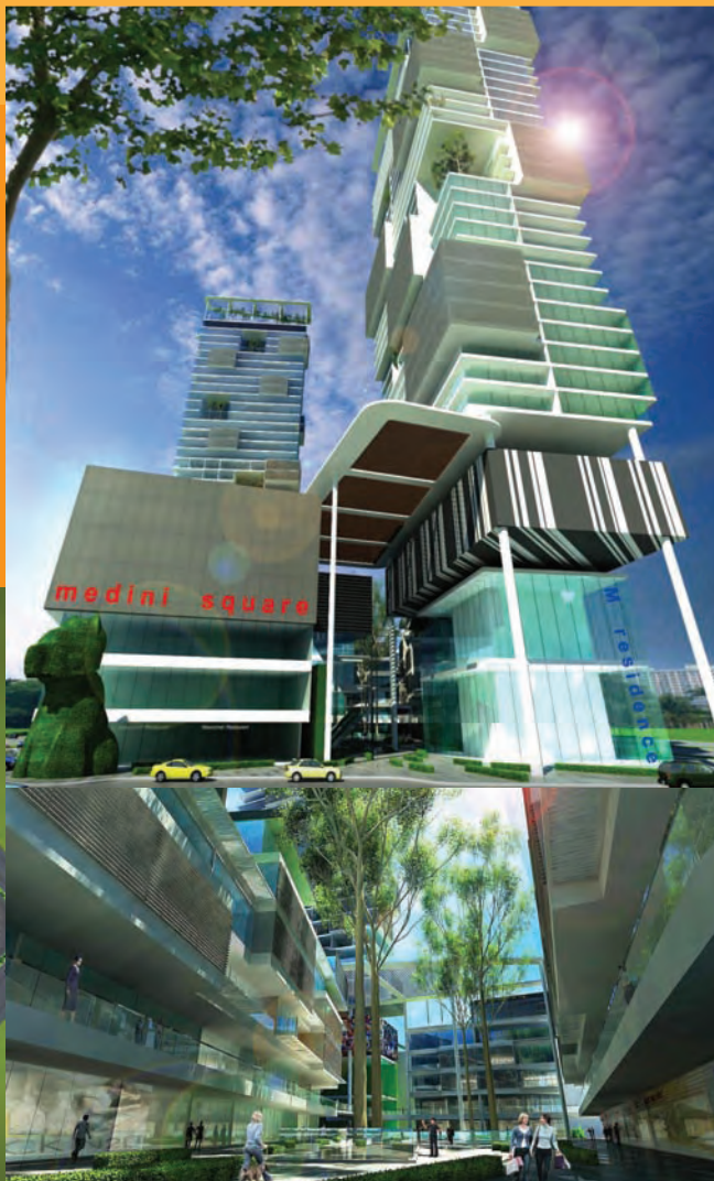
One Jesselton Kota Kinabalu

Type : 45 units of 4-6 storey shop offices, a 32 storey office tower as well as a 32 storey SOHO Amenities: Central Plaza, Alfresco Dining and beautifully landscaped gardens that includes various water features Land Size: 6.02 acres Accessibility: Within Medini Iskandar, Jalan Protokol, Johor Baharu, Johor