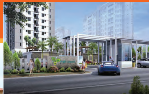
Main Place Residence, USJ 21, Subang Jaya, Selangor