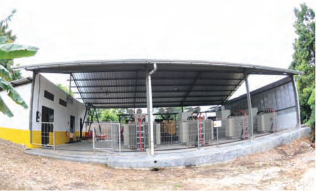
Plants located in Bangka Island, Indonesia

BPMV through PT Megapower Makmur, a subsidiary incorporated in Indonesia is supplying power with minimum supply of 2,000KW/h per plant or 48,000 KW/day for the industrial sectors throughout Indonesia, mainly in Bangka Island, a small island located close to Sumatera, Indonesia.