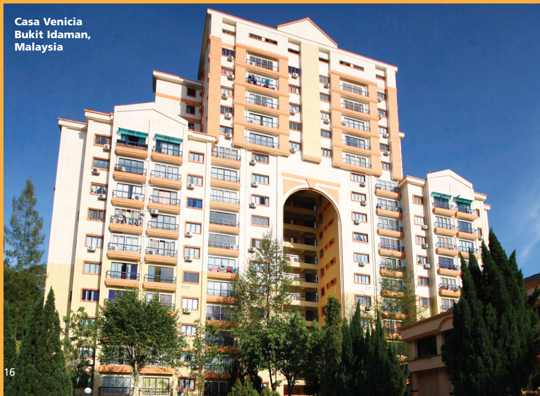
Casa Venicia Bukit Idaman, Malaysia