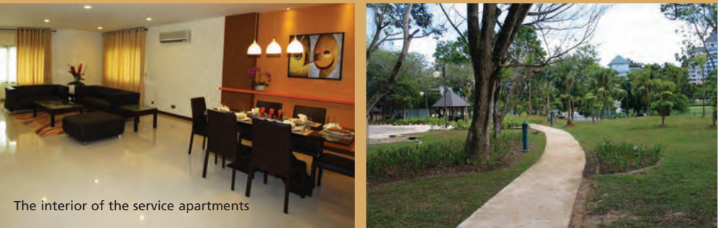
The interior of the service apartments