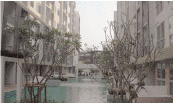
The nearly completed 8-storey A-Space Condominium, Bangkok, Thailand.