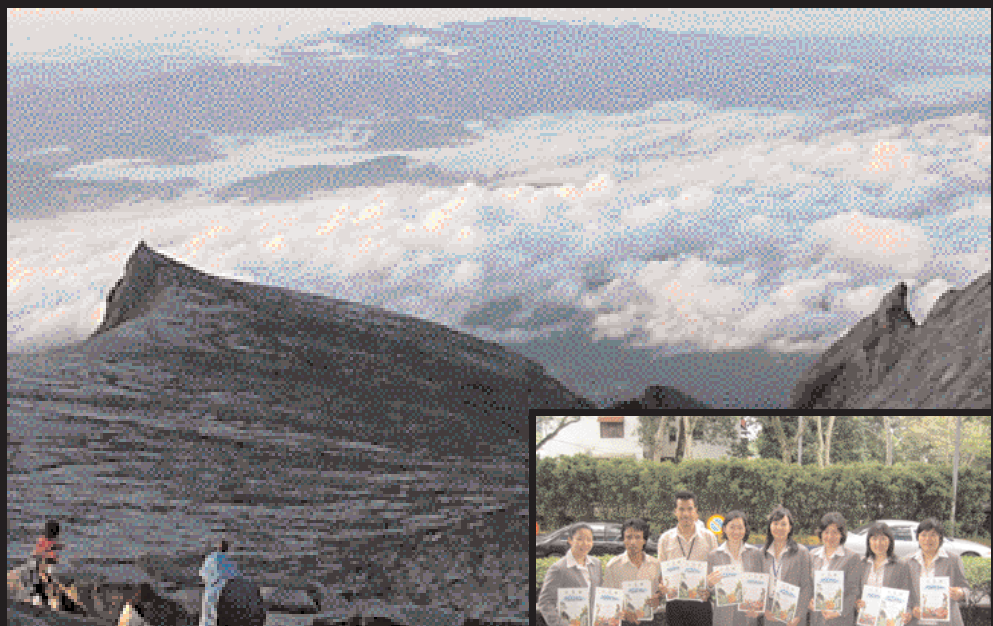
Seluas mata memandang, keindahan Gunung Kinabalu.

Pada jam 3.00 petang, kami tiba di kaki gunung dan terus menikmati makan tengahari yang disediakan di Restoran Nabal. Di situ kami masih lagi mengambil peluang untuk berinteraksi antara staff. Terpancar wajah-wajah kegembiraan dan ini merupakan pengalaman yang paling sukar dilupakan. Kepada semua staff yang masih belum lagi mendaki Gunung Kinabalu, penulis ingin mengajak anda semua untuk turut serta dalam pendakian akan datang! Ia pasti akan memberikan suatu pengalaman hidup yang indah!