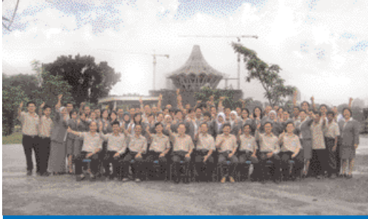
Group photograph with the Group Managing Director.