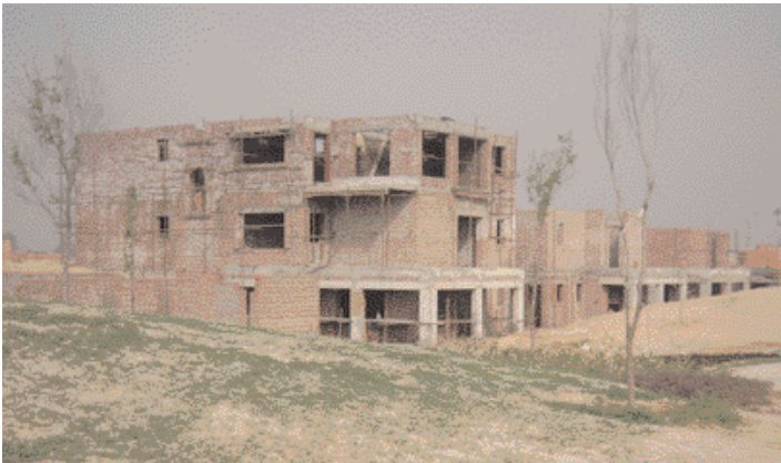
Housing Development at Lahore, Pakistan.