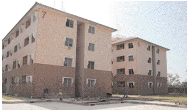
The nearly completed 4-storey apartments at Na Dee, Thailand.