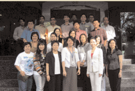
Professional Image & Business Etiquette Training, Selayang.