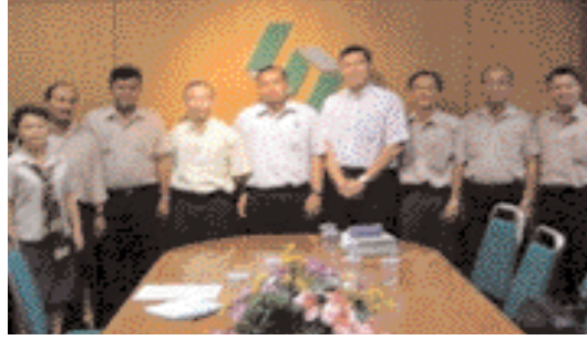
At Sg. Long Industries Sdn Bhd.