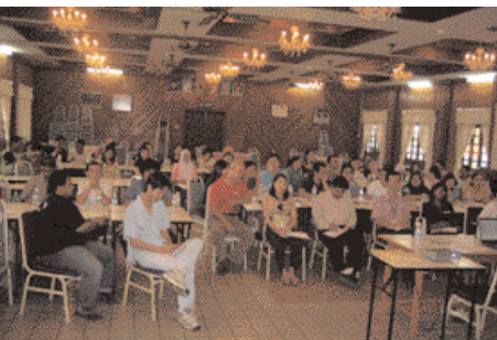
Dynamic Communication Training, Kota Kinabalu.

Also present at the signing ceremony were representatives from Kementerian Kerja Raya, Lembaga Lebuhraya Malaysia and Attorney General Chambers.