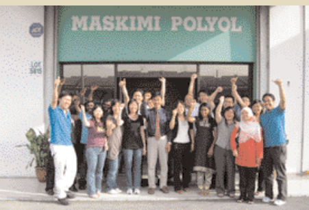
Safety in the Use of Chemicals Training, Kajang.