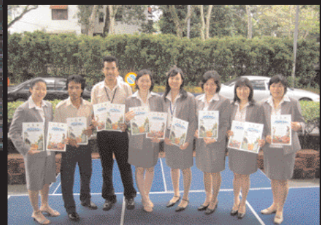
Antara Pendaki daripada Kuala Lumpur berjaya bersama Sijil masing-masing.