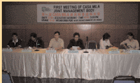
AGM in progress

The Act further provided that the Joint Management Body i.e. Casa Mila Joint Management Body & Casa Venicia Joint Management Body shall take over from the developer i.e. Ideal Heights Properties Sdn Bhd the maintenance duties and management role of the common property after the first meeting of the Joint Management Body.