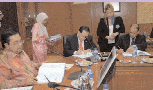
Signing the Supplementary Agreement is in progress.