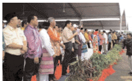
The public attending the ceremony.