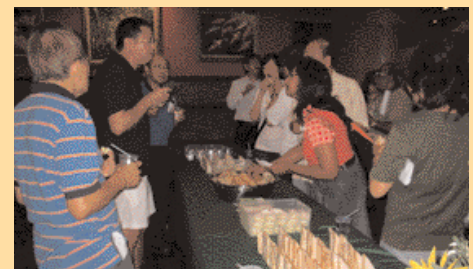
Tea reception after the meeting.