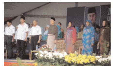
YAB Prime Minister officiated the ground breaking ceremony.