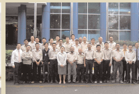
Practical Construction Drawing & Plan Reading Training, Selayang.