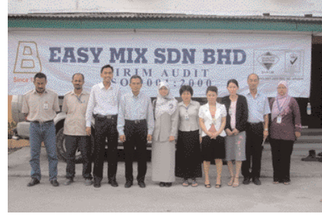
Successful Surveillance Audit at Easy Mix Sdn Bhd.