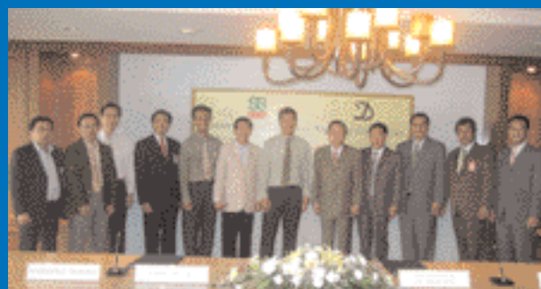
Group photo after the signing of Contract Agreement.