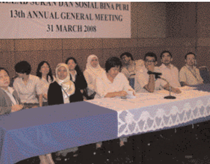
The newly elected committee.

On 31st March 2008, KSSBP organized its 13th Annual General Meeting and Election of New Committee at Ground Floor of Wisma Bina Puri. The meeting was attended by 166 members.