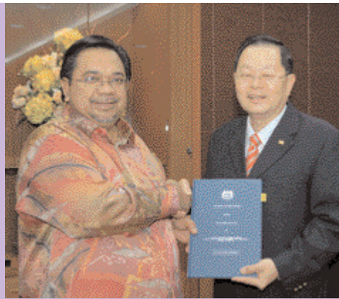
Exchange of the signed Agreement.