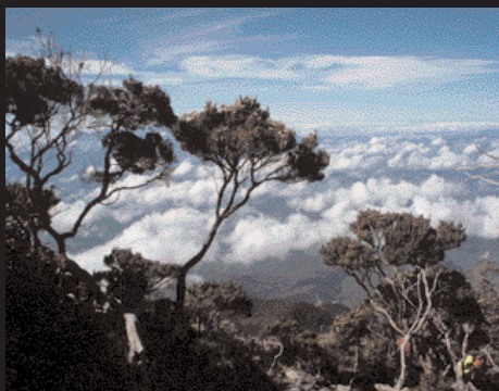
Pemandangan yang tiada bandingannya.