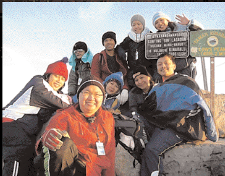
Akhirnya kami berjaya ke puncak!