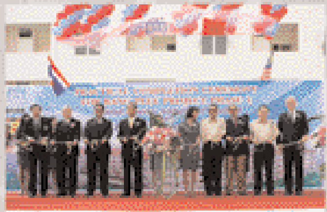
Bangplee Practical Completion Ceremony