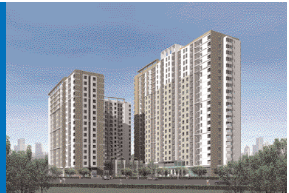
Perspective drawing of the project.