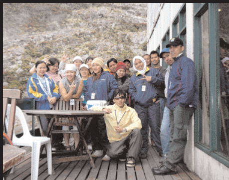
Berehat sebentar di Laban Lata sebelum meneruskan pendakian.