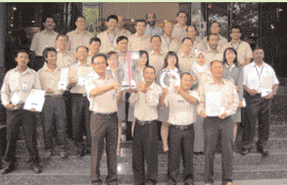
Group photo with Board of Directors.