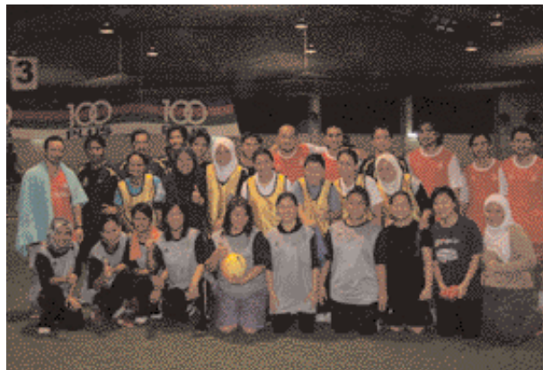
Bergambar kenangan bersama pasukan pelawat.

Namun apa yang penting ialah semangat berpasukan dan semangat kesukanan yang tinggi antara para ahli Kelab Sukan Bina Puri. Mengakhiri malam tersebut, kesemua pemain-pemain futsal Kelab Sukan Bina Puri telah dijamu makan malam di sebuah restoran berdekatan.