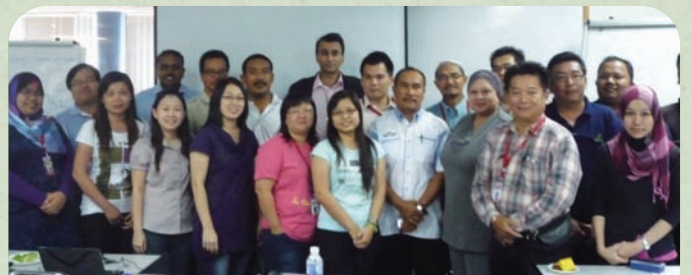
Communication Training for SLISB & MPSB