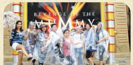
Posing again in front of the entrance of the studio

The second day was the most interesting day where they spent the entire day at the Universal Studios Singapore. There were a total of 24 attractions there with seven uniquely themed zones. The park was just too huge that one day alone was insufficient to cover all the zones.