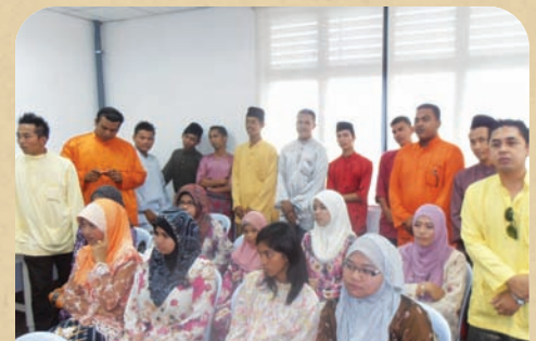
Petugas-petugas yang bekerja di musim perayaan