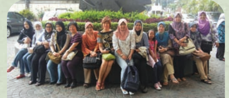
The ladies, before the final day of shopping