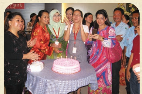
Happy birthday to us...