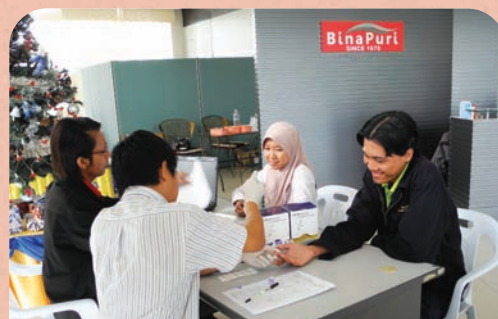
Ok kita daftar dulu ye

A blood donation drive was organised by Bina Puri Sabah's Sport & Social Club (KSSBP Sabah) on 9th November 2011 at Kota Kinabalu Regional Office. The campaign is conducted annually to inculcate responsible corporate citizens among our staff.