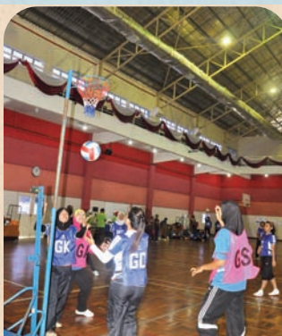
Shut!shut!..tak masuk lah bola ni kak..

konsep dibawah selian Lembaga Lebuhraya Malaysia. Kejohanan satu hari itu telah menyaksikan pasukan LATAR mempamerkan semangat juang serta kesukanan yang tinggi. Walaupun tidak memenangi sebarang pingat tetapi pasukan LATAR yang masih baru tetap memberikan sokongan kepada kejohanan ini.