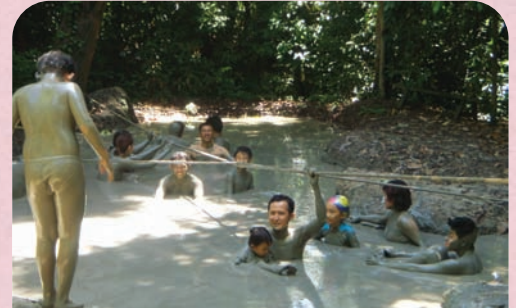
Bathing with the mud volcano