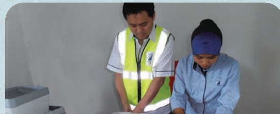
'macam tak cukup je.. mana hilang lagi RM1 ni..' boss counting his collection of the day