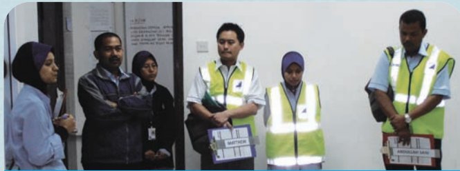
'Selamat pagi semua.. dengar sini baik-baik, semua arahan saya kena ikut dengan betul..'. morning briefing to the boss before the shift starts.

It was a great effort by the Senior Management of LATAR Expressway to experience the main operational activities. Earlier, they also attended 2-days training on hospitality management.