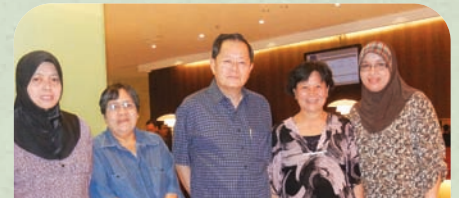
"Next time we go together lagi ye Tan Sri!"