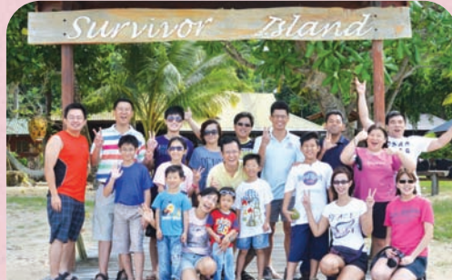
At the Survival Island - group photo

A total of 20 participants comprising of KSSBP Sabah's members and their family members took part in this trip to Pulau Tiga (Survivor Island). The trip was from 16th to 17th September 2011. Among the activities organised for the participants include jungle trekking, mud volcano bathing, swimming and beach sports.