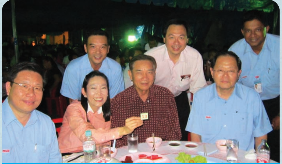
Group photo of our project team

On 6th September 2011, Bina Puri (Thailand) Ltd (BPTL) organised a Site Day carnival at Abstract Phaholyothin Park Project, Thailand. The Site Day was a unique carnival where the management and project team came together to strengthen teamwork. The carnival ended with a dinner which also included some performance. Prizes were given away to staff in recognition of their performance and contribution towards the company.