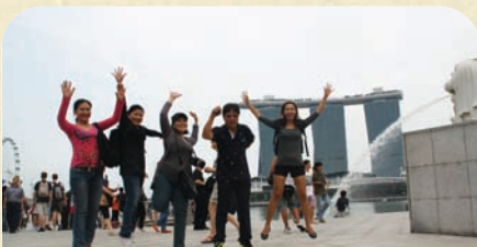
Jump high and high!