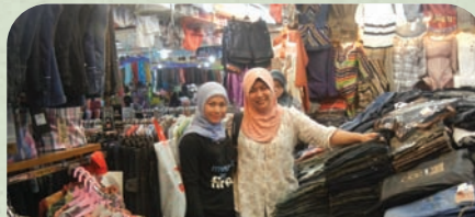
"My!! Shopping!!... murah.. murah,..."