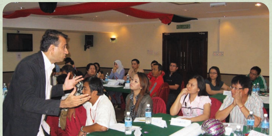
One of the many dynamic speakers in action