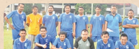
Dengan penuh semangat.. pasukan bolasepak LATAR..