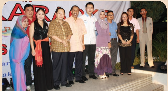
Among the contestants with the VIP guests