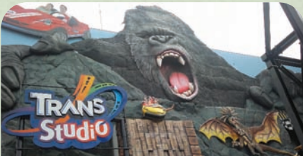
The Trans Studio, the largest Indoor themepark