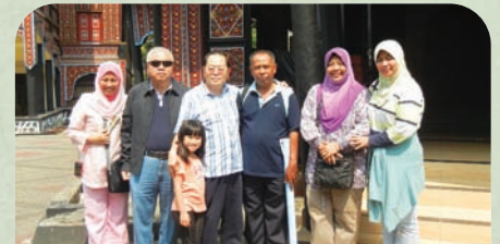
Group photo at Mini Indonesia park