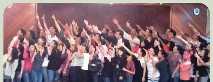
Communication training for Sabah staff