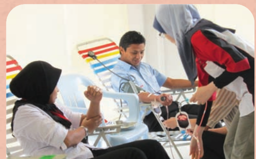
Sakit tak kak... aduhhhhh sakitnya, tetapi tetap senyum