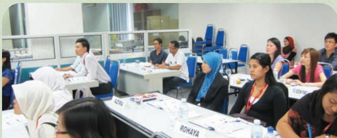
Communication training at our headquarters