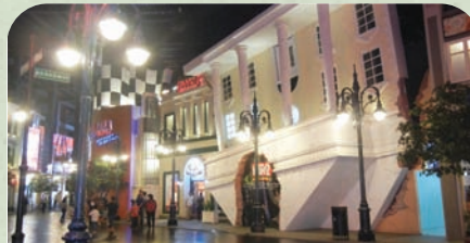
Inside the Trans Studio..