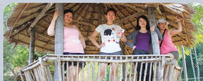
Our staff in a tree house