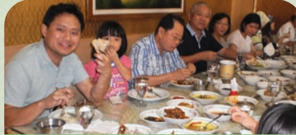
"Sedap... this is authentic Indonesian food.." at Raja Kuring restaurant