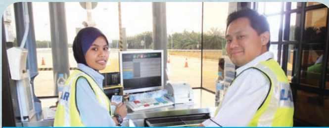
Smile first before sweating... 1st day as 'toll teller'