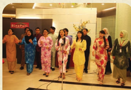
Dancing and singing