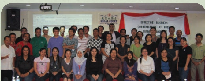
Communication Training for Sarawak Staff