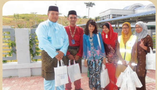
Dengan ceria semua kakitangan sempat bergambar sebelum mula kerja