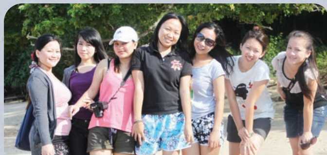
Pretty ladies at the beach

Among the activities during the trip were swimming, snorkeling and kayaking.