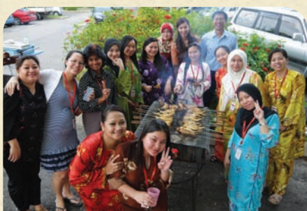
BBQ Buka Puasa