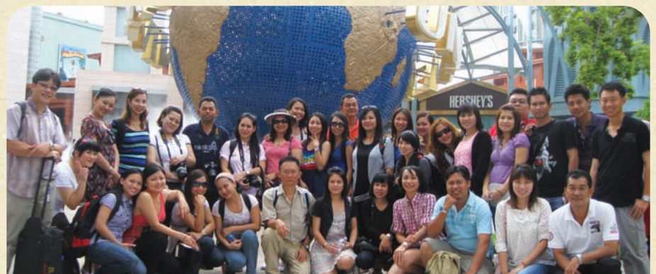
Group photo before entering the Universal Studio, Singapore

Bina Puri Sport & Social Club (KSSBP) organised a 3-day trip to Singapore from 11th to 13th November 2011. There were 125 participants joining the trip which consisted of Bina Puri staff and their family members.