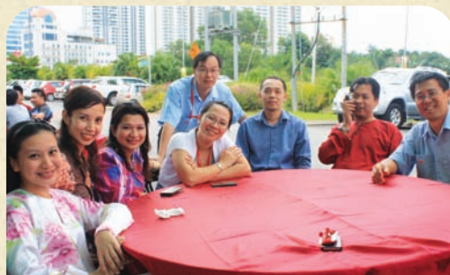
We are very muhibbah!

Our team members were treated to a sumptuous buffet dinner during the Ramadhan Buka Puasa & Staff Birthday Gathering at Sabah Regional Office (KKHQ) on 23rd August 2011. Fun was added by managing our own BBQ and our very own choir which put up a show of singing and dance for a great entertainment.