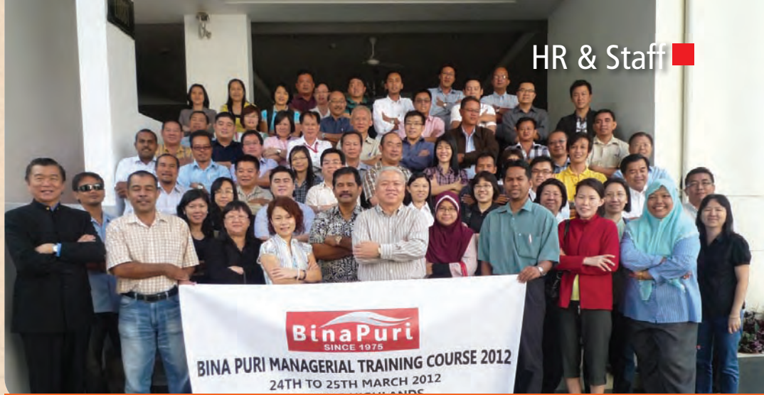
Our Chairman with the trainer and participants