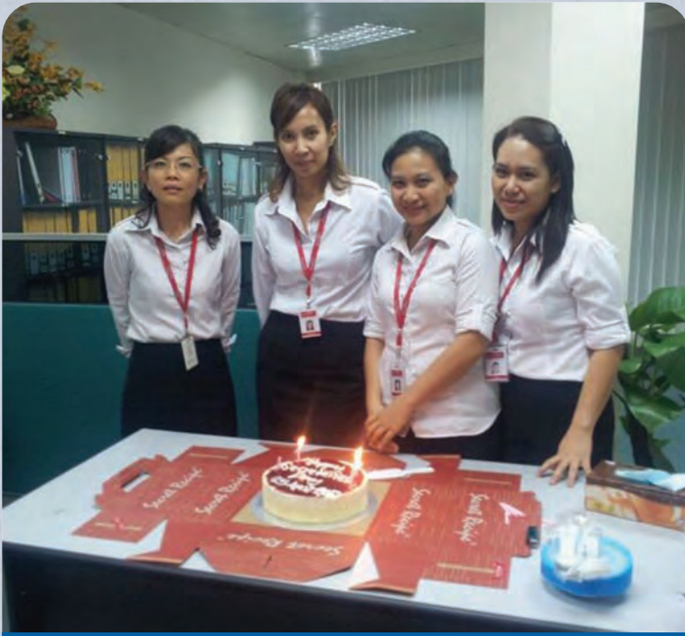
Lovely ladies posing in front of the lovely cheese cake