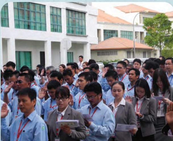
Renewal of our oath taking ceremony