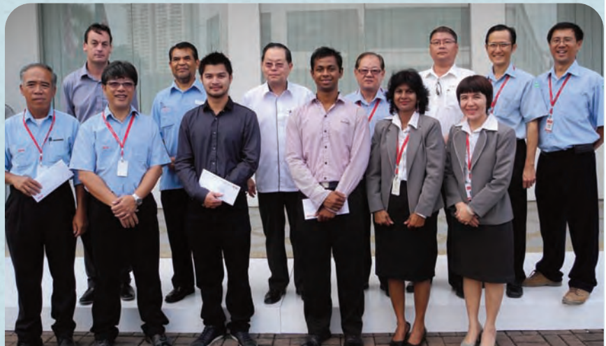
The management team with the scholarship recipients