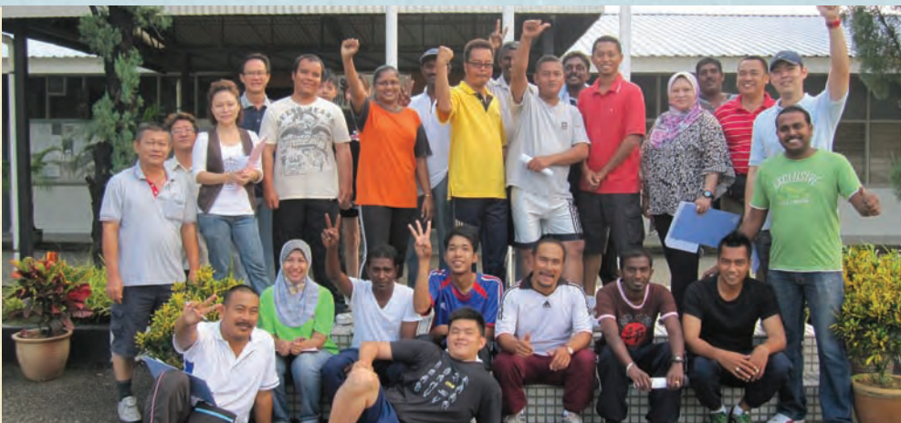
Participants of the "Quarry Race 2012"

It was fun to accomplish all tasks i.e. stepping on bricks, solve puzzles, soak & drip, blowing up balloons and finding hidden items. It's sound simple but it still needs a good strategy and teamwork. Sometimes, at our age (not old but a little above the teenage level), such games like Quarry Race is good to stimulate our 'oomph' and energize our 'battery'. Indeed the game requires good planning, attitude and teamwork to accomplish the tasks successfully.