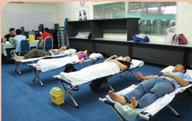
... all 1st timers