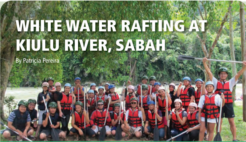
The brave and adventurous members before the action begins