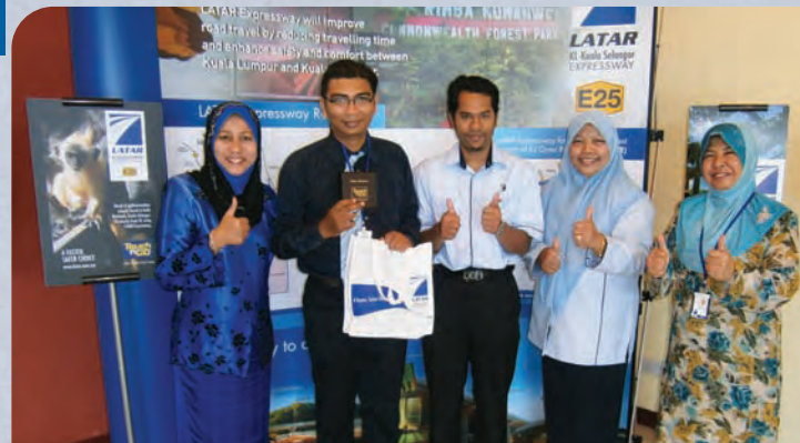
The winner with LATAR management team

The 'Write and Post' competition is an effort on LATAR Facebook to encourage the fans to throw their ideas and suggestions to LATAR Expressway as well as to update the public on LATAR Expressway