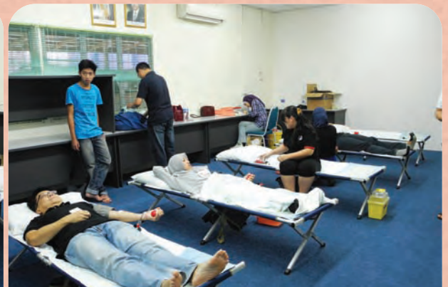
the first four BRAVE Bina Puri souls