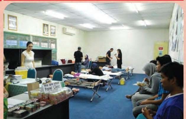
...waiting with apprehension... God bless

The campaign ran smoothly with 25 donors in the beginning but ended up with 28 donors who needed a little bit encouragement and support from others especially for those who were the first timers. Besides Bina Puri staff, there were donors from sub-contractors and daily paid workers.