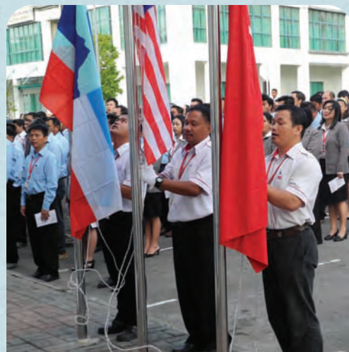
Flag hosting ceremony

Other than giving away birthday gifts to staff, the Management presented the Undergraduate Scholarship to five qualified students from amongst the staff's children.