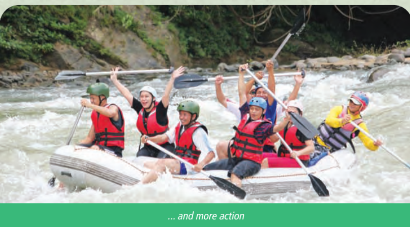
... and more action