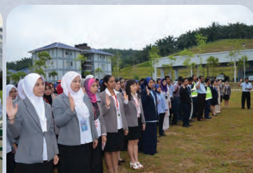
Some of the 250 staff who attended the assembly