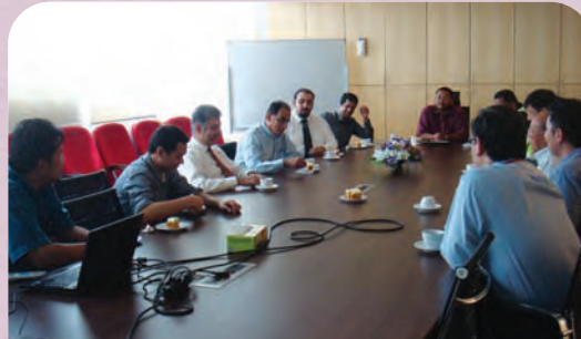
Visit by Delegates from Saudi Arabia on 24 March 2012

Since it's operations on 23rd June 2011, Latar Expressway has been serving the public well in the northern region of the Klang Valley. This has resulted in many of those using this expressway to have successfully saved time and money. As such we have received many visitors who use the highway as well as other road builders to our complex in order to understand and appreciate this expressway.