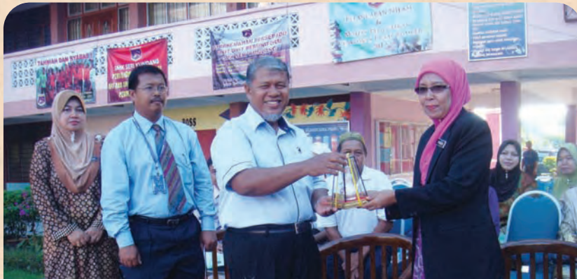
Presentation of sponsorship

Recently, KL-Kuala Selangor Expressway (LATAR Expressway) Bhd took part in a programme called Program Minggu 3K (Cleanliness, Safety & Health Week) hosted by SMK Seri Kundang from 9th to 13th April 2012. During the launch of the event LATAR sponsored in cash and two units of Emergency Telephone Number signage for the school.