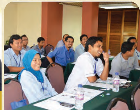
Some of the participants in a light mood