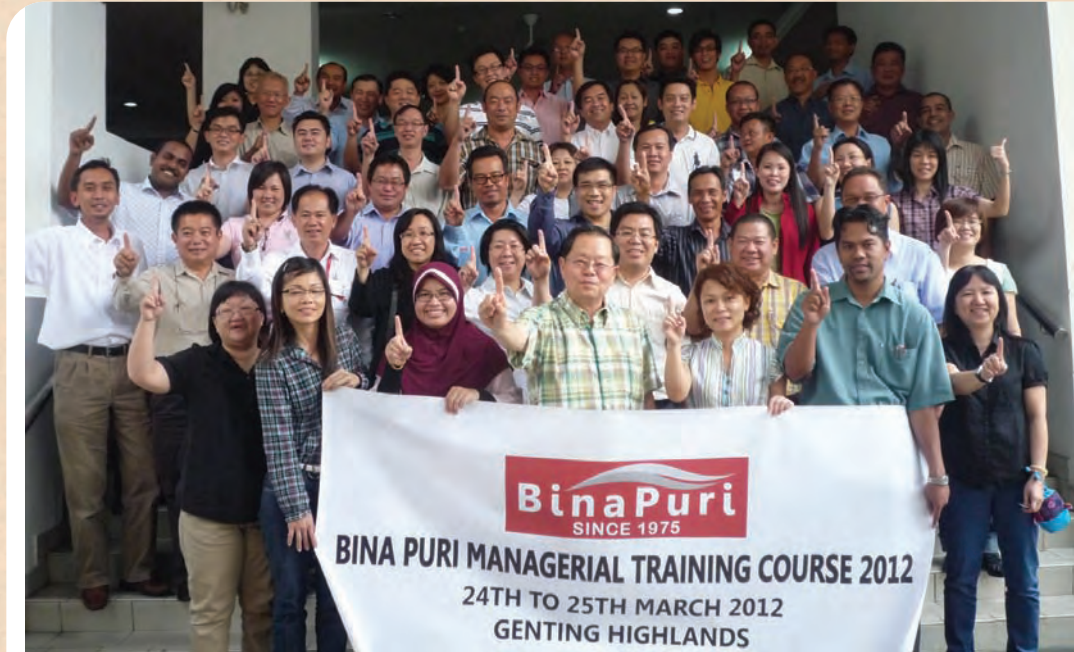
Our GMD with participants preparing to be the number '1'