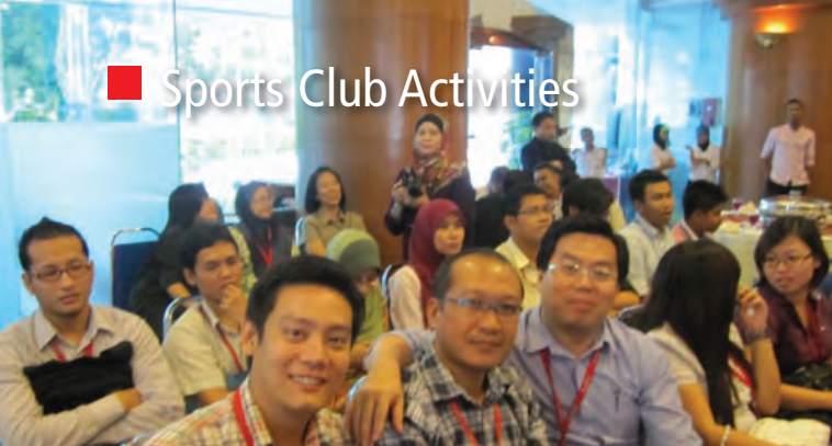
Part of the members who attended the AGM