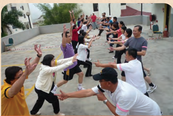
"Shooting" each other was also part of the training