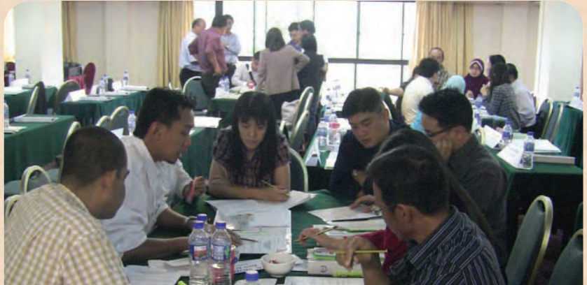
Participants deep in discussion