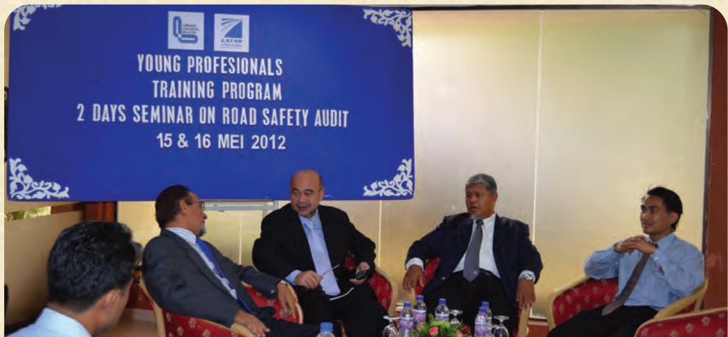
Some of the trainers before the training session begun