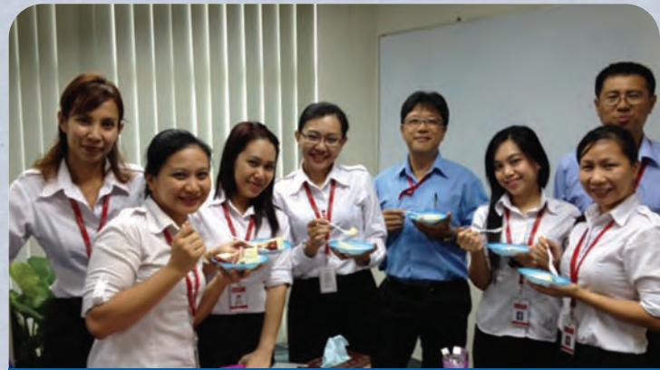
Now they indulge themselves in the cheese cake