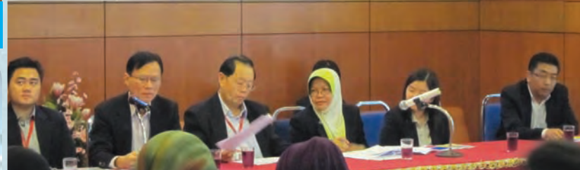
The outgoing committee together with GMD during the AGM of the sports club