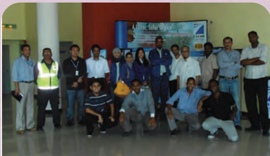
Visit by UNISEL students on 11 February 2012