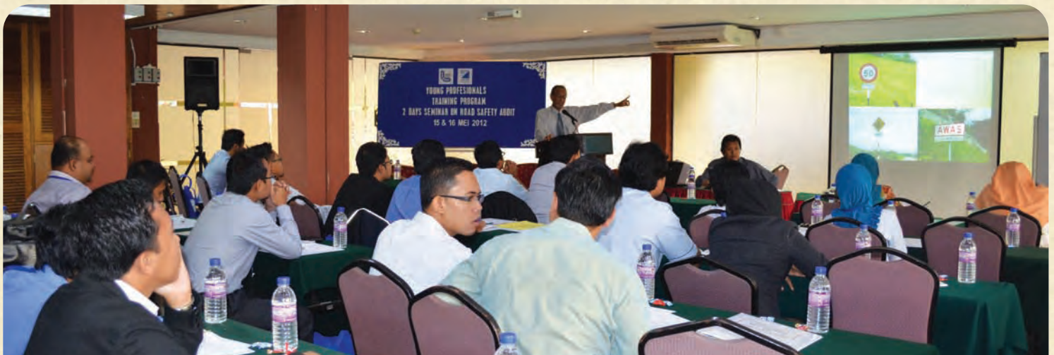
One of the training sessions