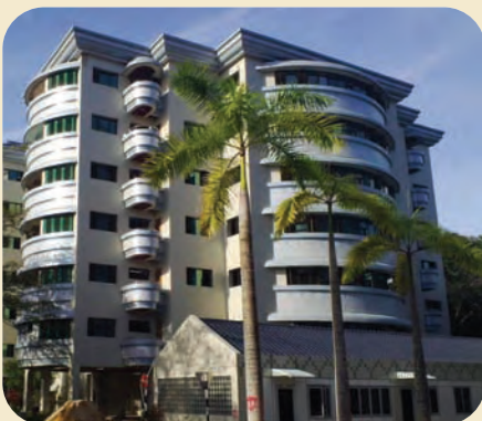
External outlook of the service apartments