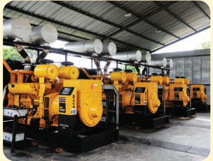
UITM CAMPUS KAMPONG PINANG, KOTA SAMARAHAN, SARAWAK