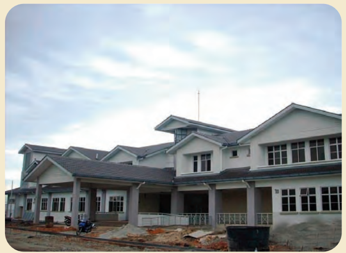
KEM BATALION 6 (PGA) PDRM, MUAR, JOHOR DARUL TAKZIM