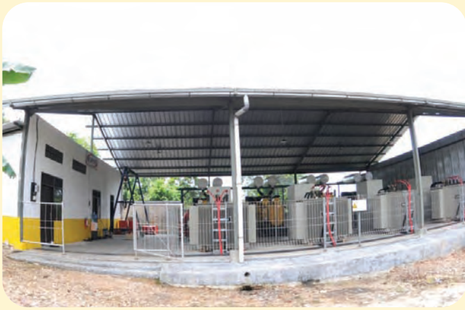
POWER PLANT, BANGKA ISLAND, INDONESIA