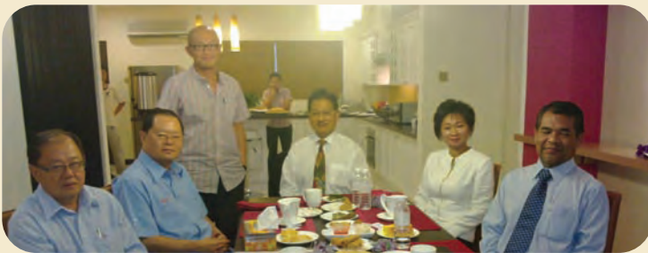
Visit by the Board Members to the apartments