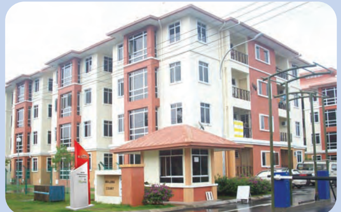
The monument was installed at Jesselton Condominium & Malawa Court, Kota Kinabalu, Sabah