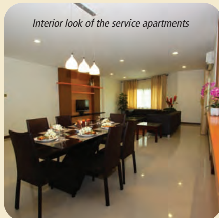
Interior look of the service apartments