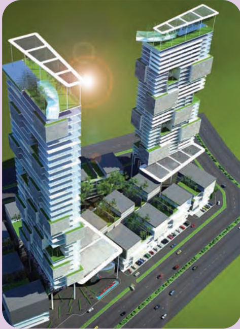
MEDINI SQUARE, JOHOR BAHRU, JOHOR ~ the new perspective