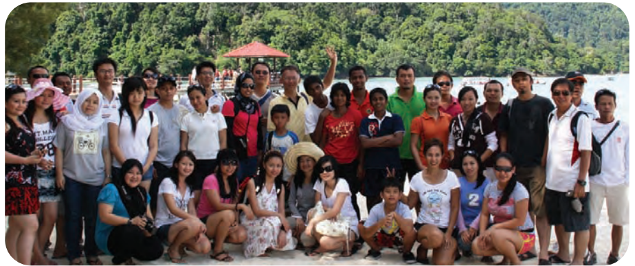
Group photo at the beach

A variety of water sports were available for participants e.g. parasailing, banana boat, sea walking, jet ski and others. The happy island goers were treated to a hearty buffet BBQ lunch before continuing snorkeling or just relaxing around the beautiful island.