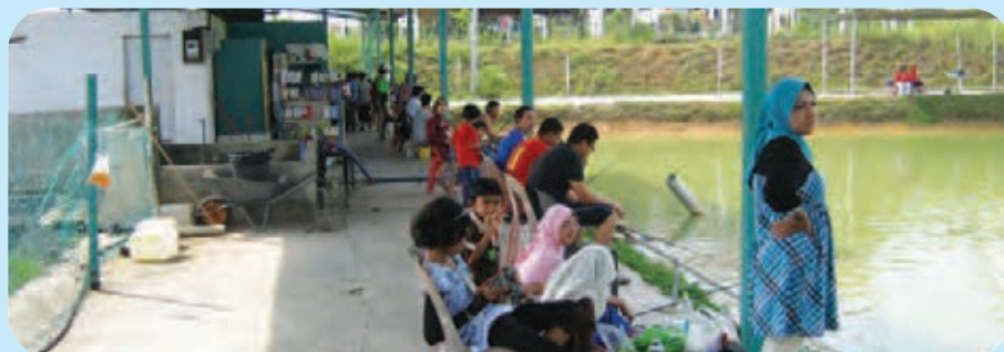
Some of the participants at the fishing venue