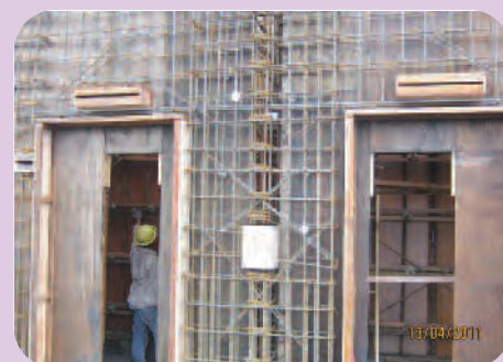
Installation of Reinforcement for Lift wall at Sains Gunaan