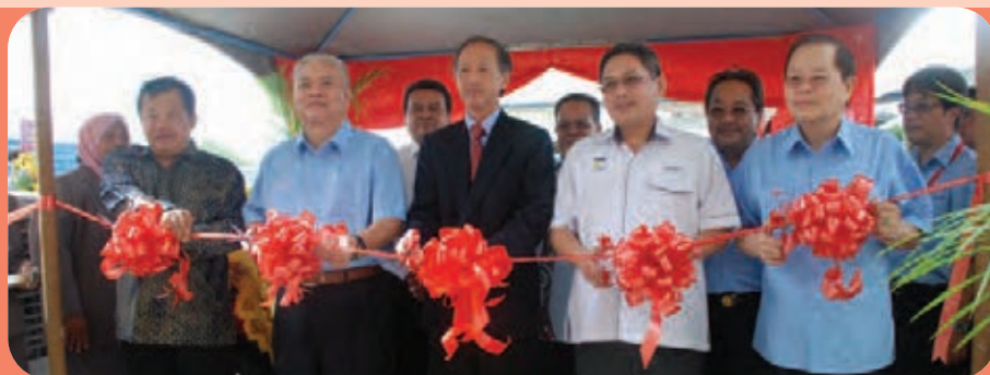
Ribbon cutting to officiate the apartment