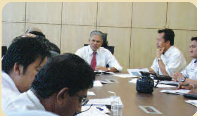
Meeting at Kompleks Operasi

representatives from other Project Consultants. MHA is looking forward to LATAR completion and hope the expressway will improve accessibility to the townships within the KL-Kuala Selangor corridor.