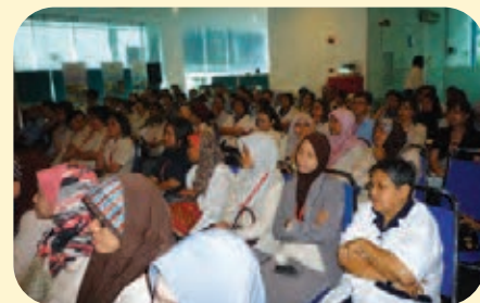
Among the club members who attended the AGM