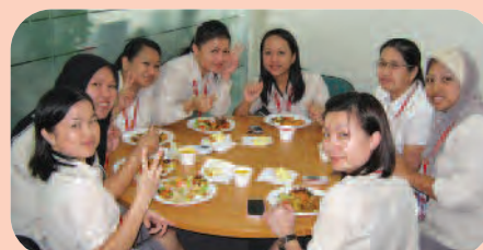
Staff enjoying lunch together