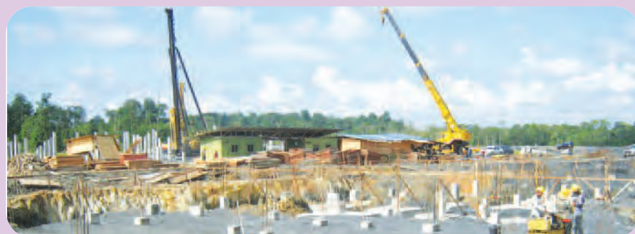
Soil compaction at site