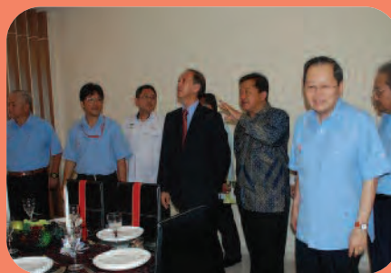
Guest viewing the sample house