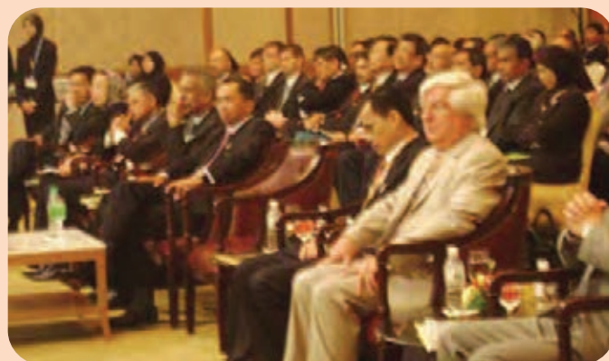
PIARC International Seminar 2011