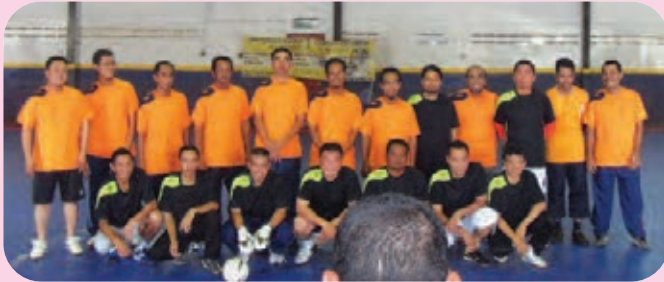
Senior team, still fit to compete

A futsal tournament was organised by KSSBP for its club members. The tournament was held on 8th May 2011 at Segambut, Selangor with a total of 8 teams participating to win the first prize of cash RM700 and trophies.