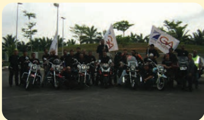
The Bikers riding on Latar Expressway to Kuala Selangor