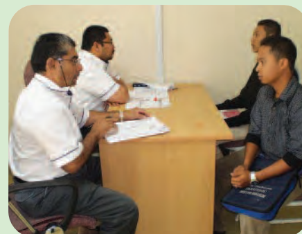
Interview session is in progress