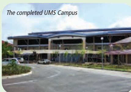
The completed UMS Campus