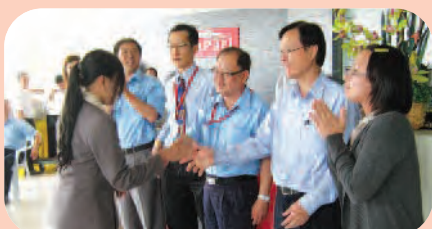
Announcement and Congratulating Newly Elected Committee