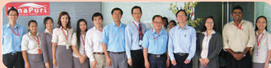
Group Photo of Newly Elected Committee