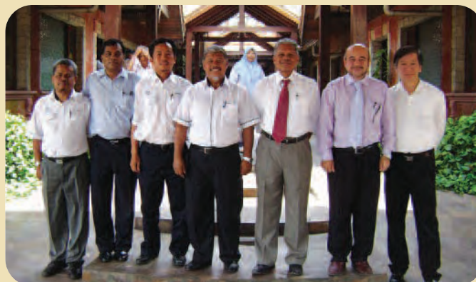
Group photo taken at De' Chiangmai Restaurant