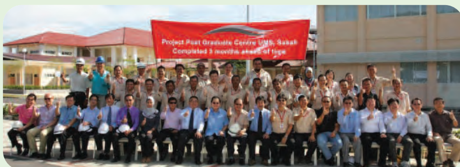
Group photo with the project team

Section 1 involved the construction of a postgraduate studies building, an auditorium, a cafeteria and other ancillary buildings. Meanwhile, Section 2 involved the construction of an academic services building and two lecture halls.