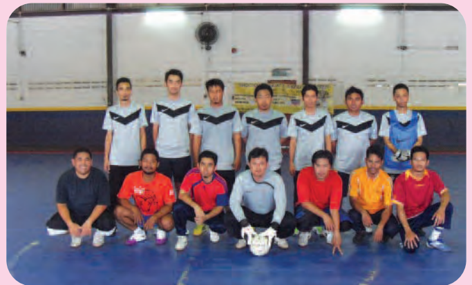
HQ Team B vs. Latar team