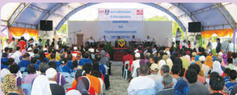
Among the public & guest attending the ceremony