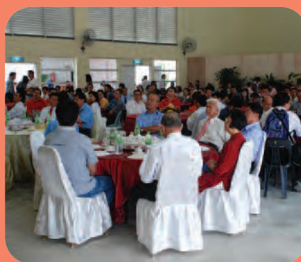
Among the guests and potential buyers