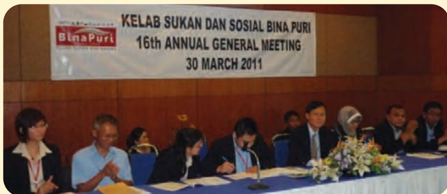
Part of the KSSBP committee members