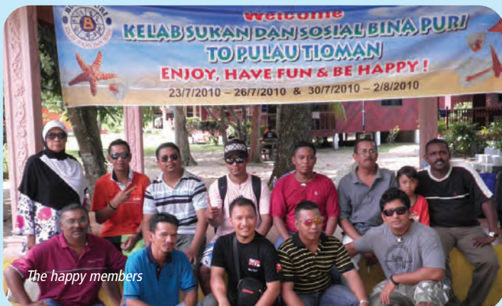
The happy members