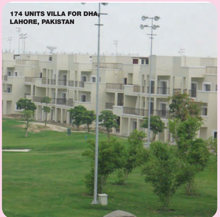
174 UNITS VILLA FOR DHA, LAHORE, PAKISTAN