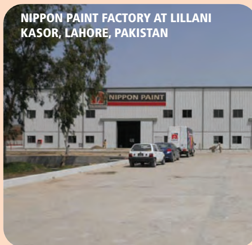
NIPPON PAINT FACTORY AT LILLANI KASOR, LAHORE, PAKISTAN