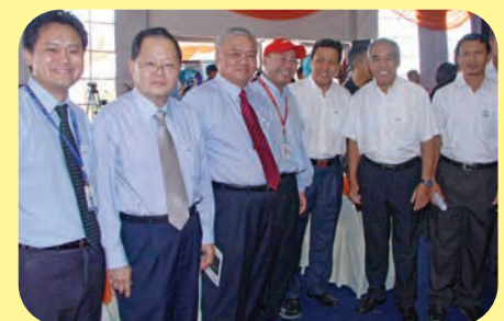
Smart partnership - UEMC - Bina Puri JV