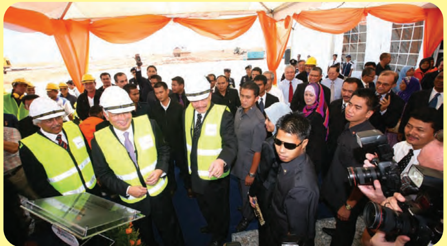
The Prime Minister launching the ground breaking. In the background are YB Senator Tan Sri Datuk Tee Hock Seng and Dato' Ir Wong Foon Meng