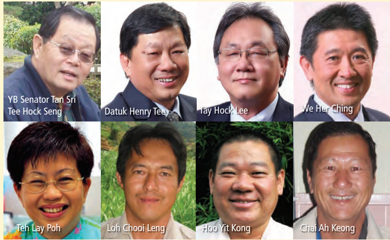
YB Senator Tan Sri Tee Hock Seng