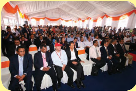
Part of the guests

Main Terminal building, a short distance away allowing ease of inter-terminal transfers and better connectivity between the two terminals.