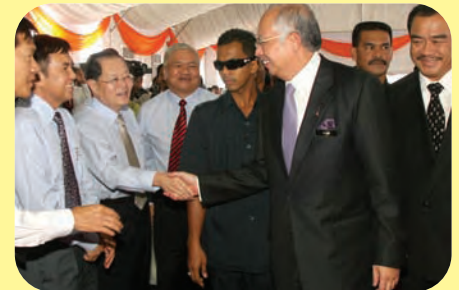
YB Senator Tan Sri Datuk Tee Hock Seng welcoming The Prime Minister