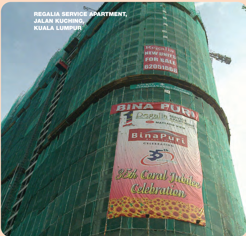
REGALIA SERVICE APARTMENT, JALAN KUCHING, KUALA LUMPUR