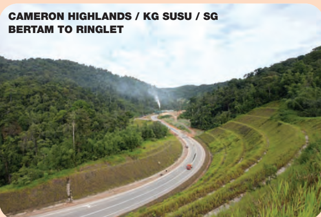
CAMERON HIGHLANDS / KG SUSU / SG BERTAM TO RINGLET