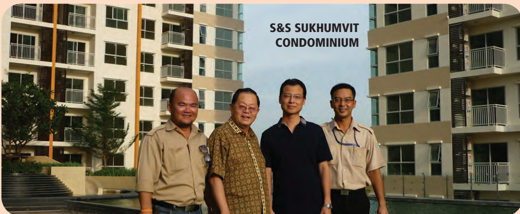
S&S SUKHUMVIT CONDOMINIUM