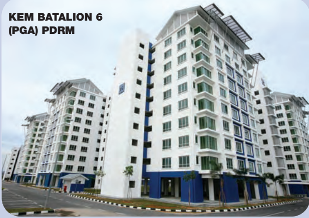
KEM BATALION 6 (PGA) PDRM