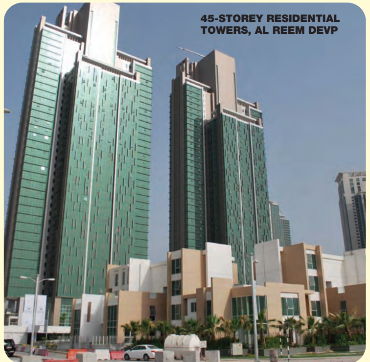
45-STOREY RESIDENTIAL TOWERS, AL REEM DEVP