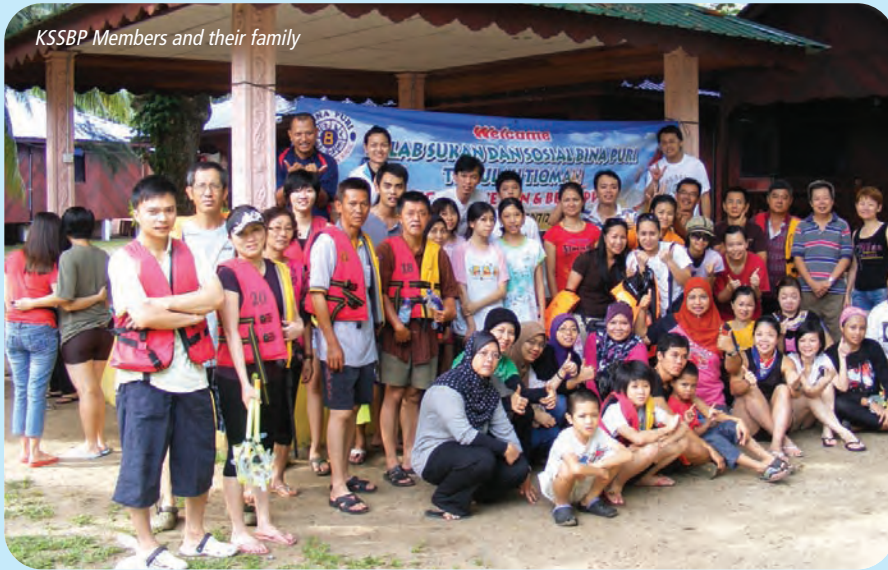
KSSBP Members and their family