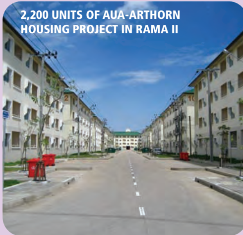
2,200 UNITS OF AUA-ARTHORN HOUSING PROJECT IN RAMA II

Bina Puri Ventures Sdn Bhd was the Management Contractor to construct one (1) unit raw Material Warehouse Building & Emulsion Plant and One (1) unit Raw Material Warehouse (Enamel) together with ancillary buildings and related external works with contract sum of RM16.55 million for the Nippon Paint (Pakistan) (Private) Limited.