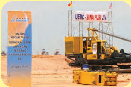
The site of the project

The construction of the new terminal for low cost carriers was officially commenced following a ground-breaking ceremony launched by the Prime Minister YAB Dato' Sri Mohd Najib Tun Hj Abdul Razak on 30 August 2010 at the project site in Sepang.