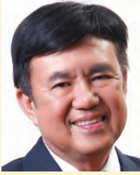
Dr Tony Tan Cheng Kiat