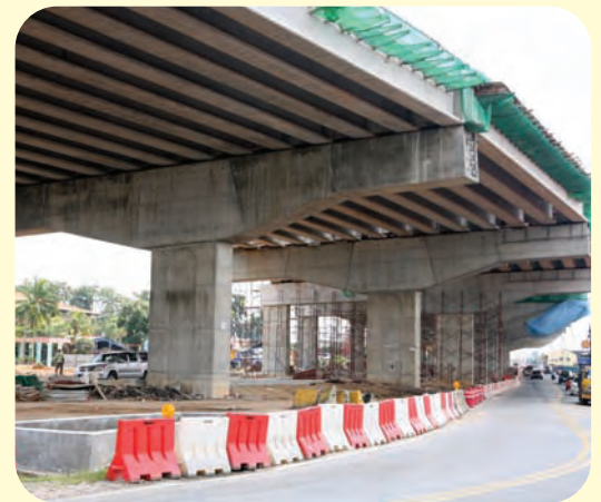
EASTERN DISPERSAL LINK (EDL) JOHOR BAHRU