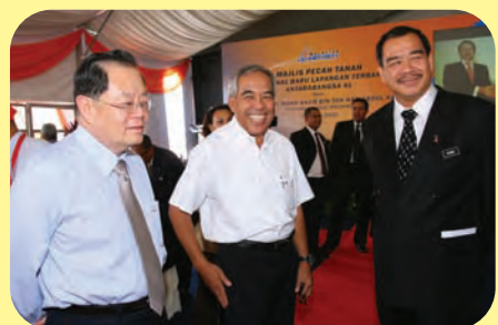
The partners with YB Dato Seri Kong Cho Ha, Minister of Transport