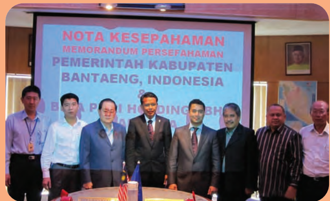
Group photo shoot after the signing ceremony