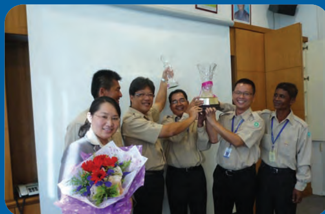
The winning team from Kota Kinabalu, Sabah