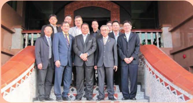
Visit of MBAM Council to Malaysian Embassy China on 12 May 2010