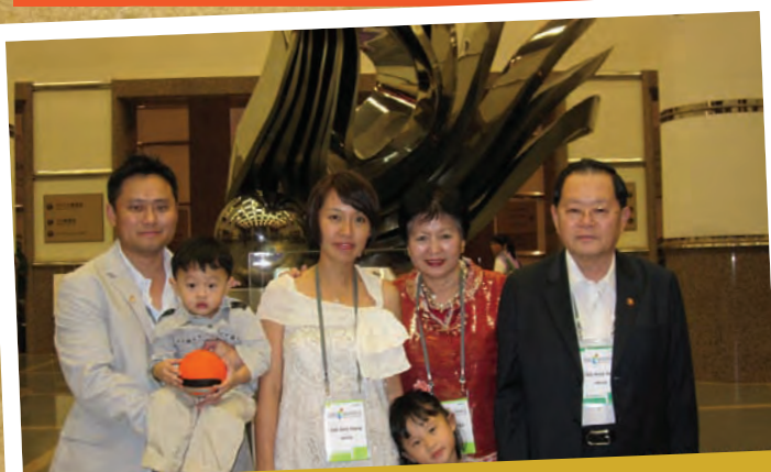
Bringing the family members for official duties