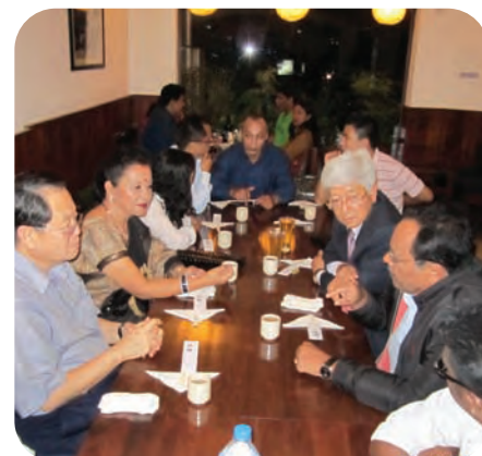
A networking dinner with the local business leaders.