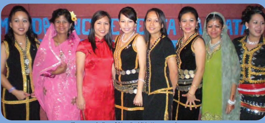
The pretty ladies of Bina Puri 'Ms Kaamatan' contest

The event was so enjoyable and everybody felt that it is good if possible to be organised every year.