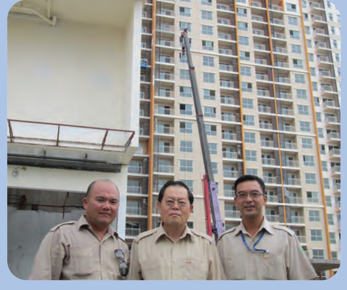
YB Senator Tan Sri Datuk Tee Hock Seng visited Sukhumvit 101 on 28 June 2010