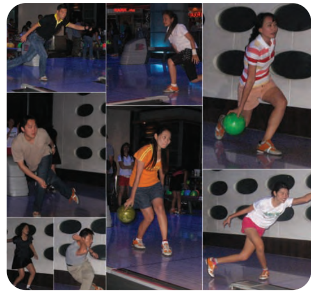
The show! In Action!