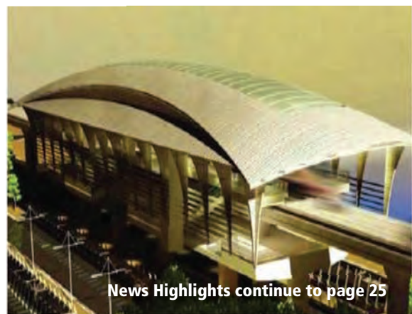
News Highlights continue to page 25