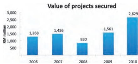
Geographical breakdown of on-going projects

The Group is looking to hit turnover in excess of RM1.2 Billion, and increase of more than 50%, while looking at a minimum net profit increase of more than 70% as compared to 2009.