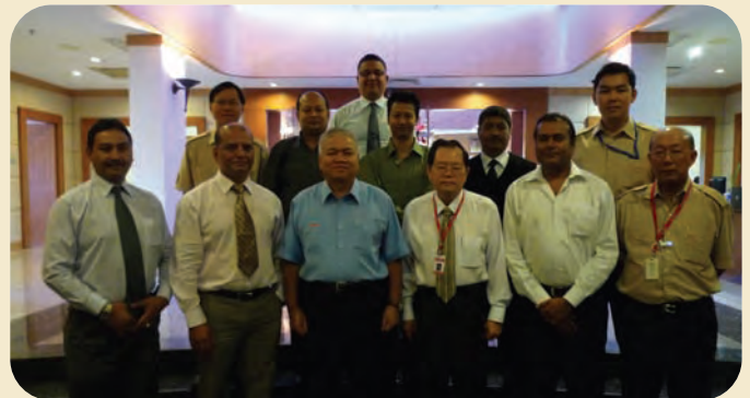
Group photo after the signing ceremony