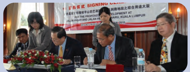
The signing ceremony