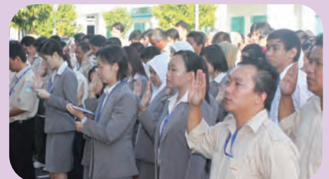
Ikrar reading by the loyal employees