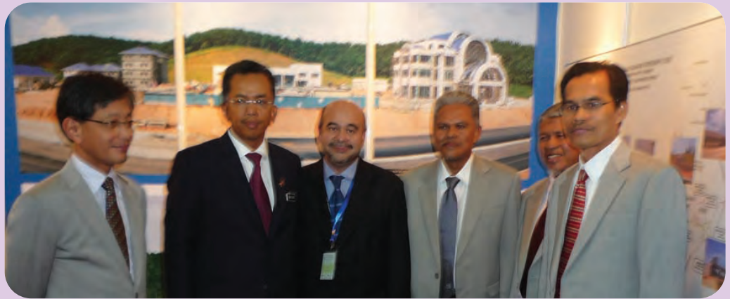
YB Dato' Shaziman Abu Mansor, Minister of Works Malaysia (2 nd from L) who visited our exhibition booth at the 8 th Malaysian Road Conference.

Meanwhile, on 12 th October 2010, a group of 30 conference participants had a study tour to the site of the LATAR.