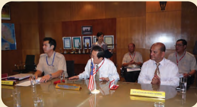
The signing ceremony taking place at the Exco floor, Wisma Bina Puri